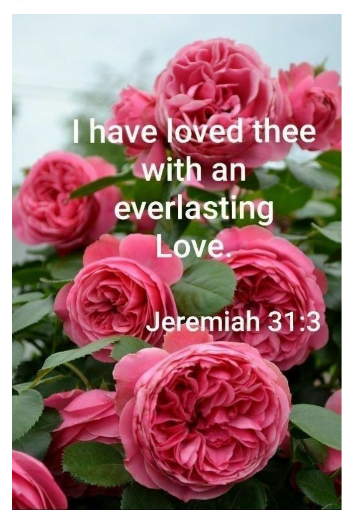
FEBRUARY 2025 NEWSLETTER